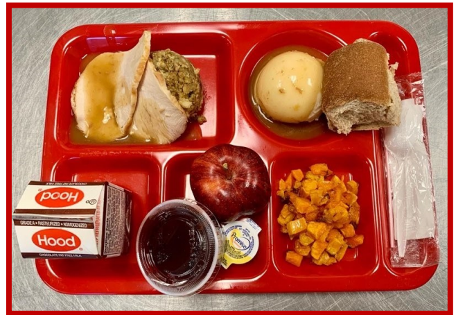
Tray of the day at Lincoln Elementary School